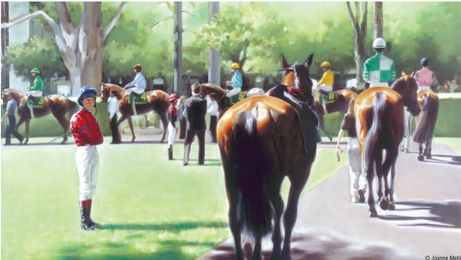
"Keeneland Classics", oil on canvas, 5' x 7'