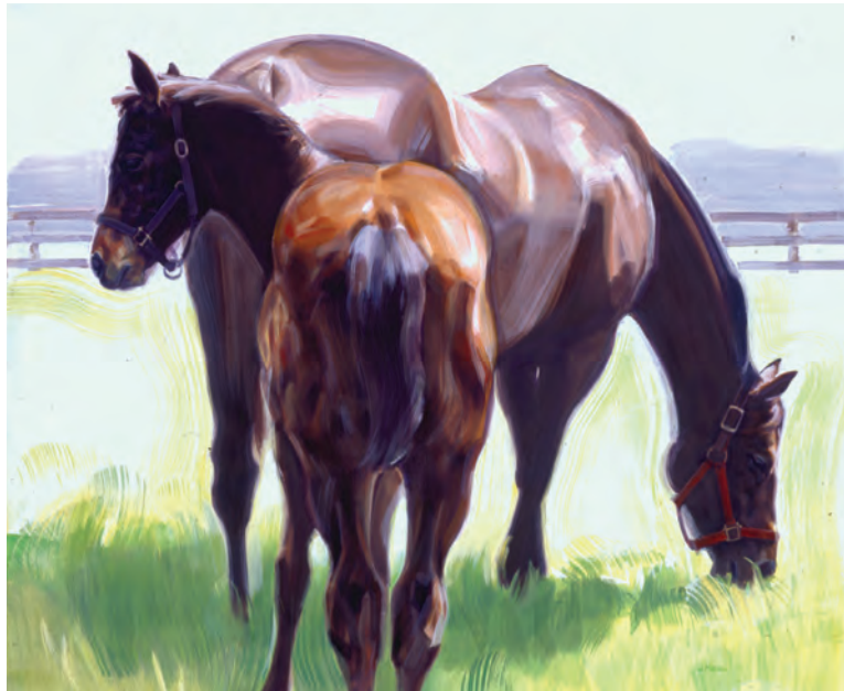
"Mare and Foal, Lexington, KY", gouache on acid free board, 16 x 18"