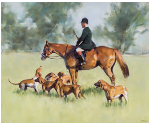
"Waiting on Their Master", oil on panel, 16 x 20"