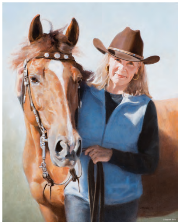
"Merry and Player", oil on panel, 11 x 14"