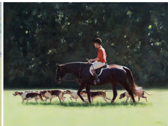
"Constellation", oil on panel, 18 x 25"