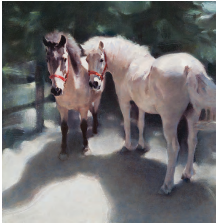
"Obie and Clowney, the Christmas Ponies", oil on panel, 20 x 24"