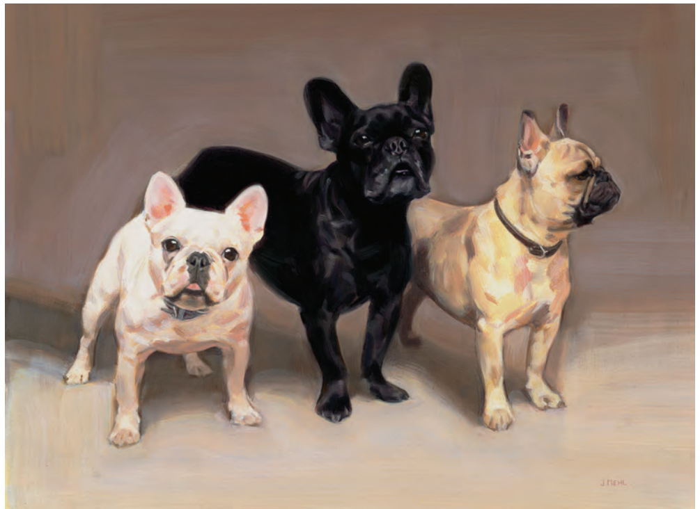
"Streeper Bulldogs", gouache on acid free board, 9 x 12"