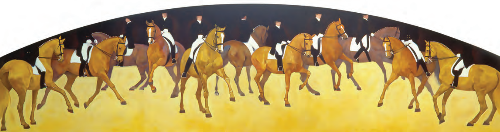
Devonwood Mural, acrylic on MDO board, 12' x 47'