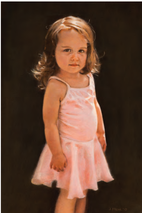
"Melia", Oil on Panel, 8 x 10"