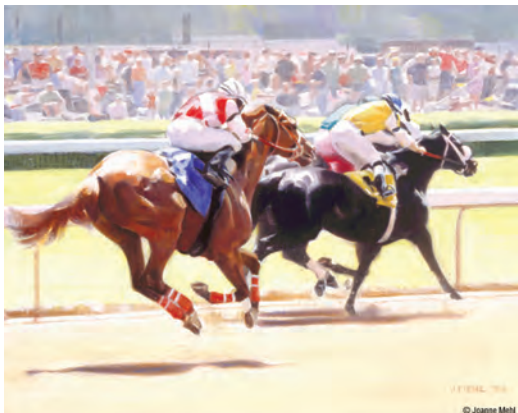
"A Brief Moment of Sun", oil on panel, 8 x 11"