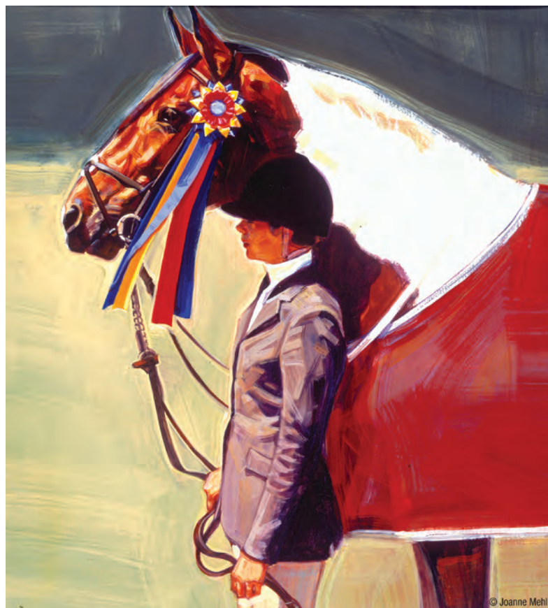
"Red Cooler", gouache on acid free board, 8 x 10