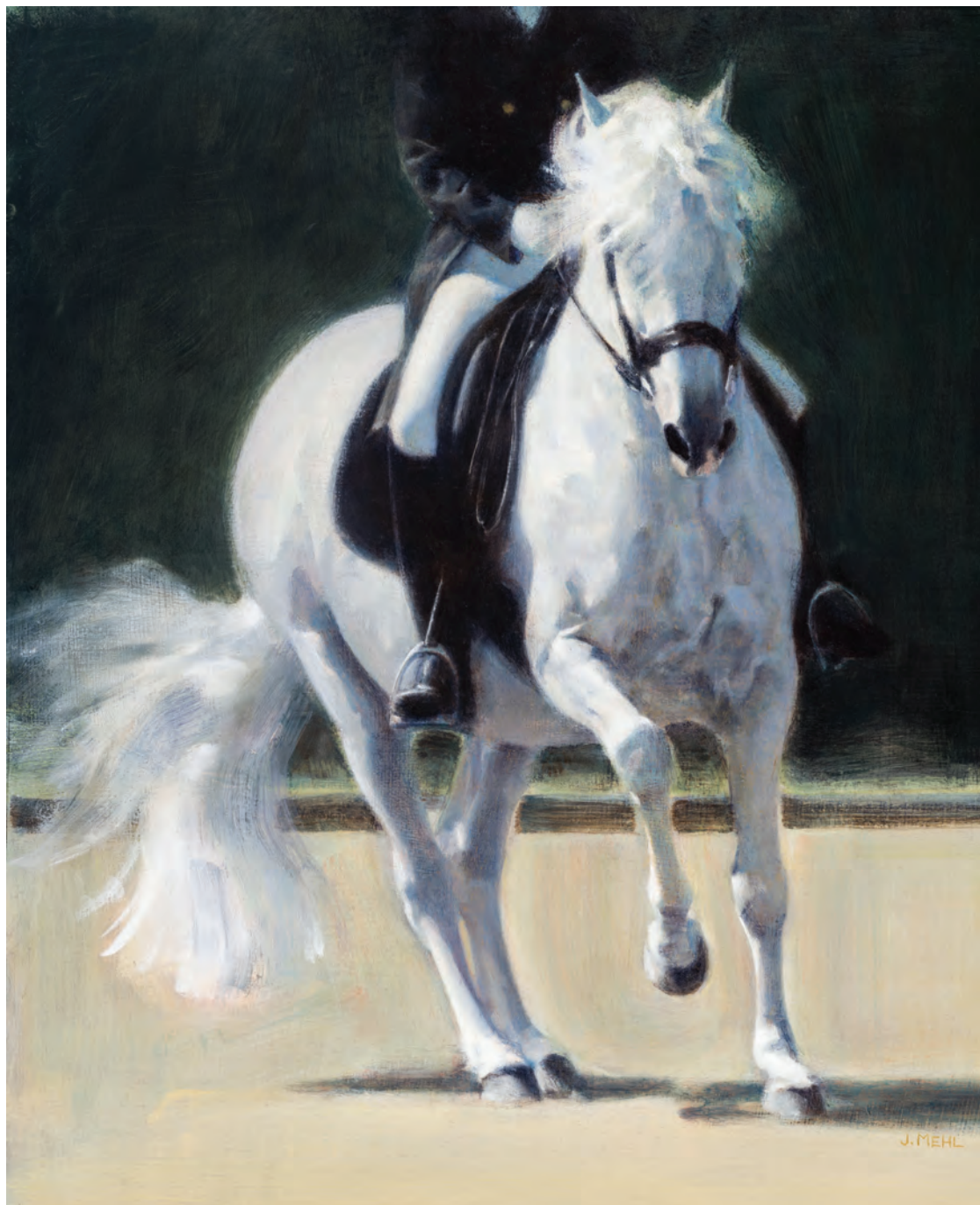
"Pirouette", oil on panel, 10 x 12.5"

Not long after that I got a call from Cross Gate Gallery in Lexington, Kentucky, wondering if I'd ever considered painting racing scenes. So that led me to explore that whole world, with its history, pageantry and incredibly dynamic scenes. A high point was when the State of Kentucky bought a 4 x 7 foot painting for their Governor's mansion. That was pretty gratifying. We were in the Jeep heading for the John Day when we got the call. My burger pretty much went airborne."