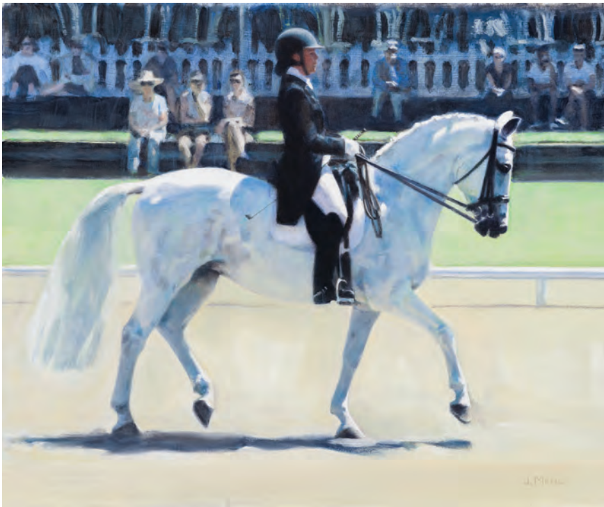
"Colors of White", oil on panel, 14 x 11"